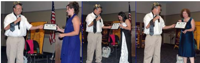
The Remington Angels shared the "Spark-Plug of the Year" award for all of their hard work throughout the 2005-2006 year.